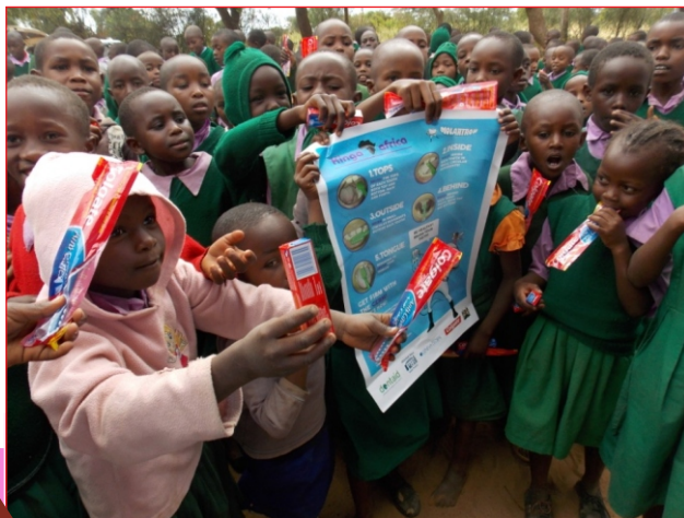
Pupils after receiving educational materials

Behavior Change is a process that needs commitment, time and resilience to attain. One-off encounters with new knowledge may not be enough to inculcate new habits. After a review of the impact made by one day lessons and brushing demonstration in schools, a need to change approach was birthed. The new approach gives the children an opportunity for monitored brushing three times a day. The program educates the children, parents and teachers and gives them toothbrushes and paste to use in school and at home. The children brush their teeth twice at home and during lunch time at school for at least thirty days. This has brought out excitement and desire to keep it going among the teachers, community and the children. There are notable improvements on their oral health and brushing of the teeth has become a must do activity, three times a day. This calls for more toothbrushes, toothpaste and toothbrush storage kits.