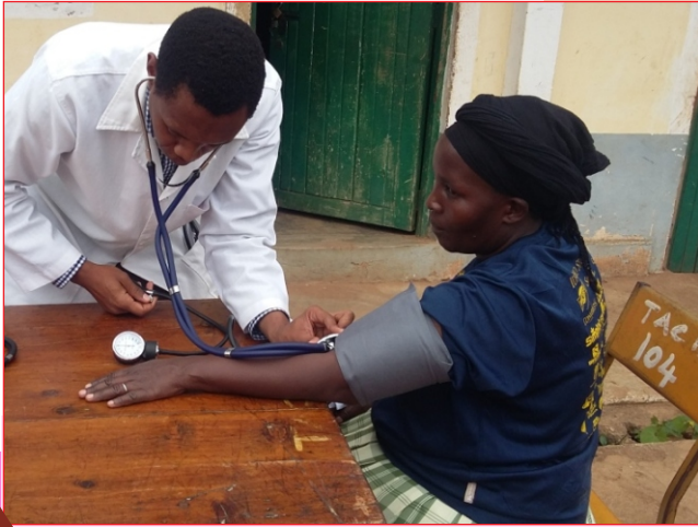
A volunteer takes the BP of a patient