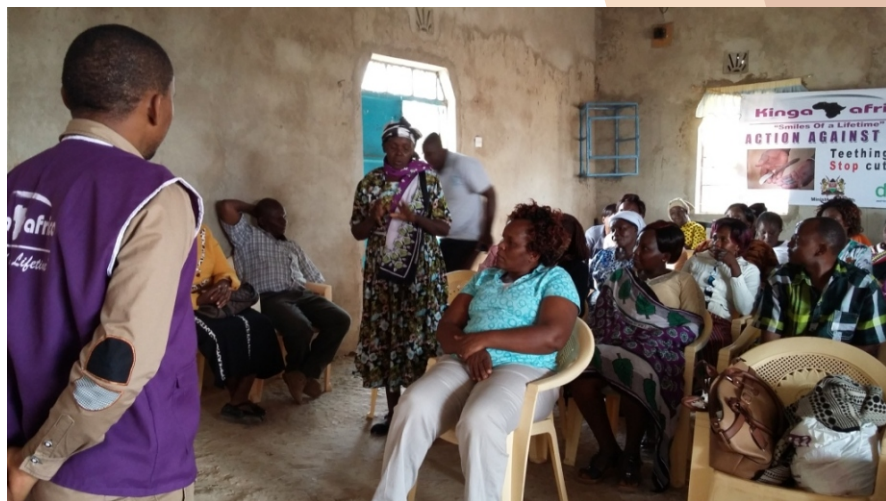
Trainings on impacts of IOM