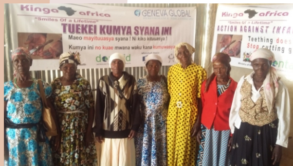
traditional healers after a training session