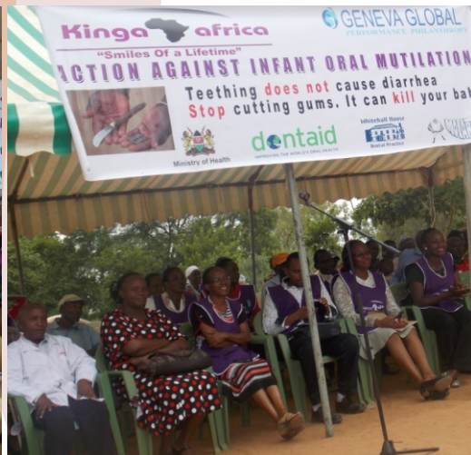
A session on impacts of IOM