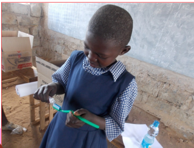
A pupil demonstrates after a successful training