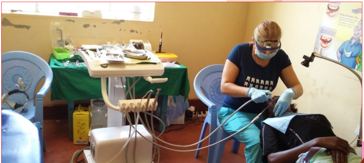
A recent dental camp

To make this program work more effectively, we need volunteer dentists, dental students, and medical practitioners to participate in these programs.